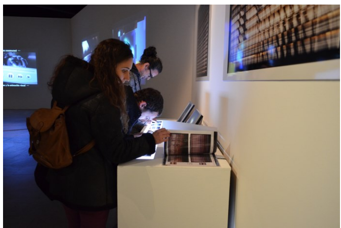
Exhibition View at the 12° Bienal de Artes Mediales, 2015