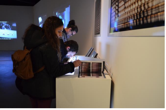
The 18th Japan Media Arts Festival, 2014